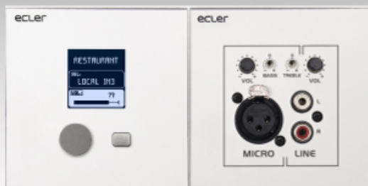
eMCONTROL1 + WPaMIX-T + WPa25MBOX