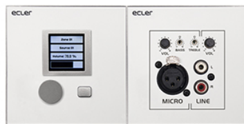
eMCONTROL1 + WPaMIX-T